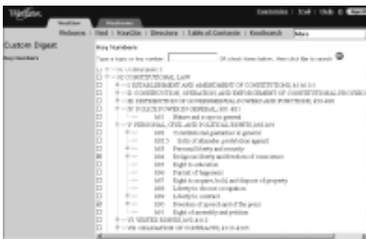
Custom Digest page

You can quickly scan the headnotes in your Custom Digest search result to identify cases that are useful to you. KeyCite® status flags indicate that information for a case is available in the KeyCite citation research service. Hypertext links allow you to retrieve the full text of cases and other references (such as annotations from American Law Reports and articles from journals and law reviews) without leaving your result. Turn to page 5 to see how to use the Custom Digest.